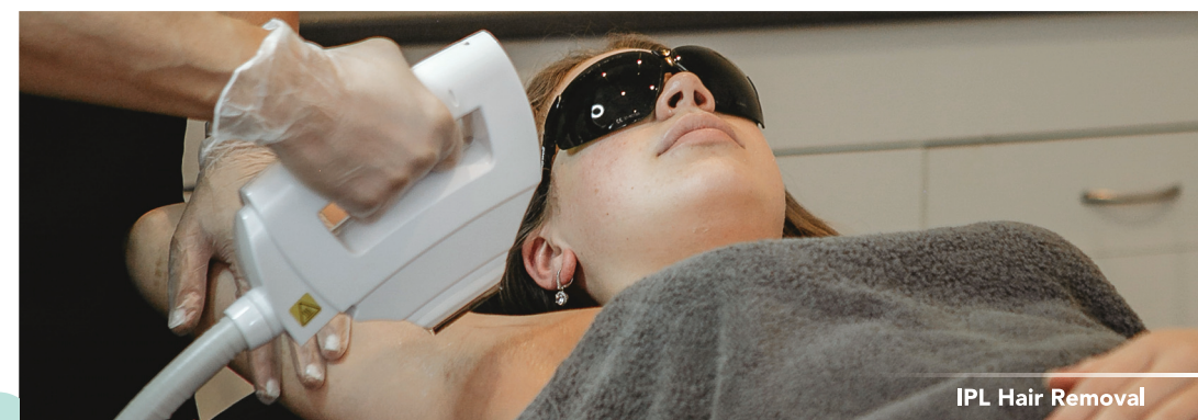
IPL Hair Removal